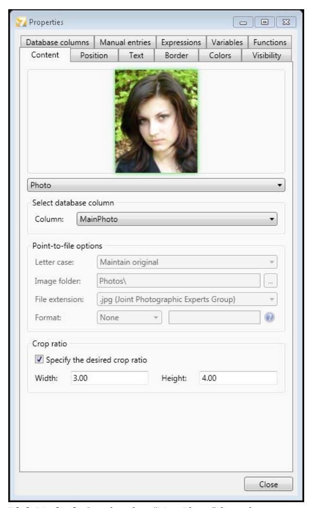
Blob Method: Simply select "MainPhoto" from the Column.