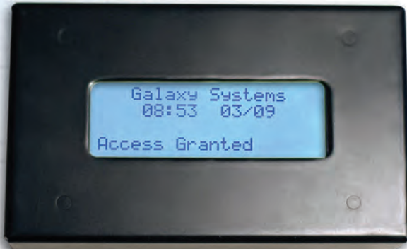
Typical LCD display on a reader door following a successful card swipe.