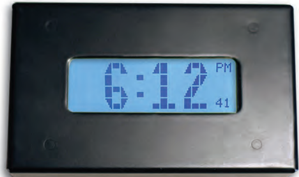
Using the LCD as a time clock.