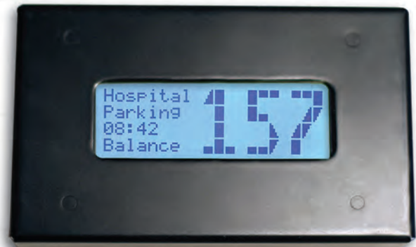
Parking Application with using large numbers to display card balance.